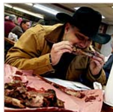
Texas Haute Country