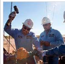
Tapped Out in Texas, but Hopeful for Oil