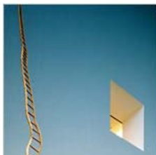
Humanity's Ascent, in Three Dimensions