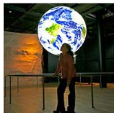
The Blue Planet's Lifeblood: A Finite Flow