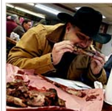
Texas Haute Country