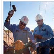
Tapped Out in Texas, but Hopeful for Oil

Home | World | U.S. | N.Y. / Region | Business | Technology | Science | Health | Sports | Opinion | Arts | Style | Travel | Jobs | Real Estate | Automobiles | Back to Top Copyright 2007 The New York Times Company | Privacy Policy | Search | Corrections | RSS | First Look | Help | Contact Us | Work for Us | Site Map