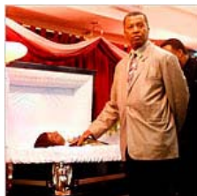
On the Ground: Gang Violence