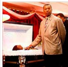
On the Ground: Gang Violence