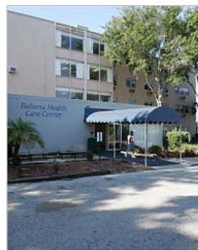
After Habana was bought in 2002, its managers laid off workers and increased its occupancy.

Representatives of all the investment groups that bought nursing home chains since 2000 — Warburg Pincus, Formation, National Senior Care, Fillmore Capital Partners and the Carlyle Group — were offered the data and findings from the Times analysis. All but one declined to comment.